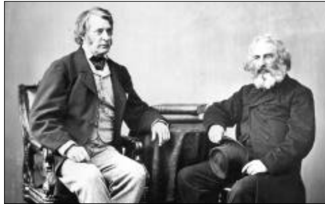
Charles Sumner and Henry W. Longfellow, 1863