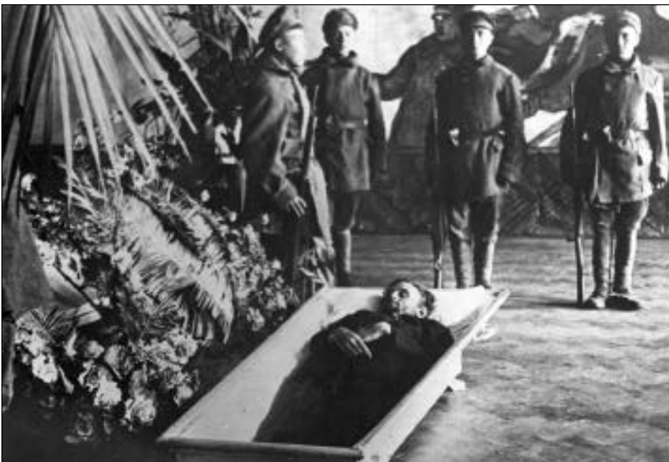
John Reed in coffin in Moscow, October 1920