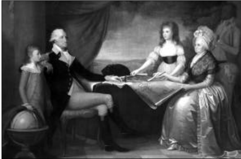
Edward Savage's "The Washington Family, 1789-1796" with George and Martha Washington, her two youngest grandchildren, and slave Billy Lee[?].

On December 30, 1775, Washington issued new orders: "As the General is informed that Numbers of free Negroes are desirous of inlisting, he gives leave to the recruiting Officers to entertain them, and promises to lay the matter before Congress, who he doubts not will approve of it."