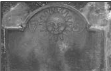
Vassall fireback in upstairs bedroom