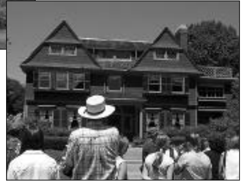
Visiting Edith Longfellow Dana's house

Country Day School glee club's performance of Spanish Christmas carols at Symphony Hall: "No sooner was our program concluded when the doors at the back of the hall opened and in came a scruffy crowd waving big red flags and lustily singing the 'Internationale.'"