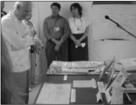
Touring the House archives