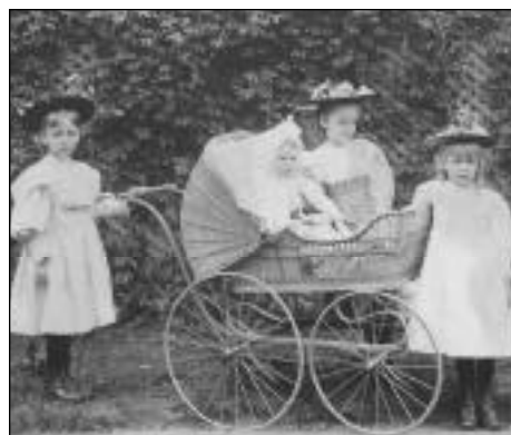
May 1895