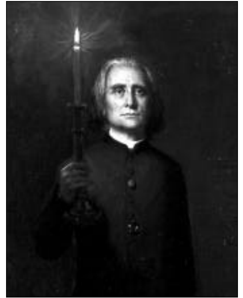
Franz Liszt (detail), G.P.A. Healy, 1869

The art and furniture at the Longfellow House reflect the family's love of music.