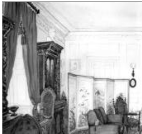
"Library of Craigie House," Mary King Longfellow, 1876

resents a wealth of items ranging from mantle fringes and summer slipcovers to family clothing and upholstery. The textiles are documented by letters in the House