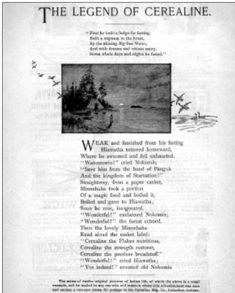
Harper's Magazine Advertiser's parody of Longfellow's poem.

This fall public television's American Experience will air a program based on Simon Schama's book Dead Certainties about the infamous murder of Dr. George Parkman in 1851 by Harvard professor Dr. John Webster, a friend of Henry W. Longfellow. Researchers for the program used journals and letters of the Longfellow family in the House archives.