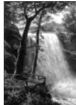
Falls of Minnehaha, water- color, by Lord Dufferin

The name Hiawatha is found in Colorado, Iowa, Kansas, Michigan, Utah, Oklahoma, and West Virginia. His mother's name, Winona, is even more widely represented, appearing in Arizona, Idaho, Indiana, Kansas, Minnesota, Mis- sissippi, New Hampshire, South Carolina, and Ten- nessee—a far-flung group of states, indeed—and often in several locales within a state. The heroic grandmother, Nokomis, is remembered in places named after her in Alabama, Florida, Illinois, and Vir- ginia, while the corn god, Mondamin, slain by Hiawatha, is honored nonetheless in Iowa, zip code 51557. Ponemah, Longfellow's "land of the Hereafter," region of the "Islands of the Blessed," whence Hiawatha sails in Bierstadt's painting, is on the map in Illinois, Minnesota, and New Hampshire. And the settlers of Knox County, Illinois, chose the melodious name Dahinda for a site in that state. According to Longfellow's glossary at the end of The Song of Hiawatha the word—deceptively mellifluous—means Bullfrog.