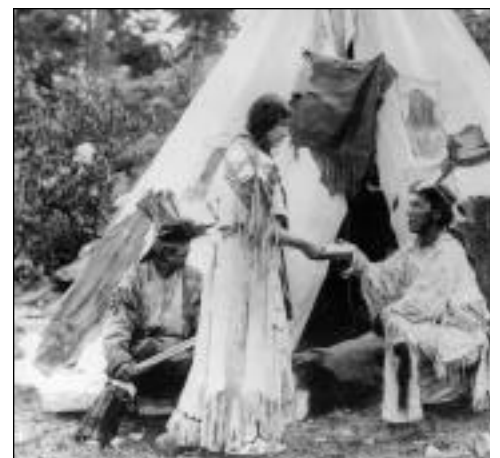
Minnehaha and Hiawatha in the 1901 Ojibway