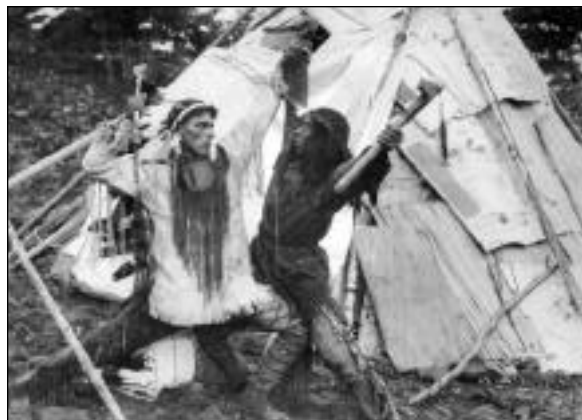
A fierce encounter from the 1901 performance of Hiawatha

The invitation was cordially accepted, and in August the party of guests, twelve in all, left the train at Desbarats on the north shore of Lake Huron; there they were met by the Indians in full costume, and in sailboat and canoes they set forth for the little rocky island, which had been prepared for them.