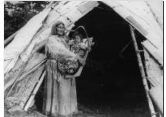
Old Nokomis with little Hiawatha in the 1901 performance

grouped around this were tepees and huts forming the Indian village. Behind this the ground sloped gradually upward, forming a natural amphitheatre.