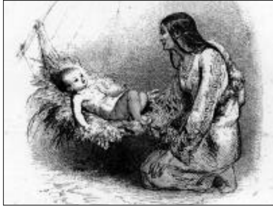
George H. Thomas illustration, The Song of Hiawatha , London, 1859

When Hiawatha was first published in 1855 it sold rapidly. With an initial printing of five thousand volumes, four thousand were already sold as of its November 10 publication date. By mid-December eleven thousand volumes were in print. Longfellow's publisher, James T. Fields, announced in January that they were selling three hundred copies a day. Forty-three thousand copies of Hiawatha had sold