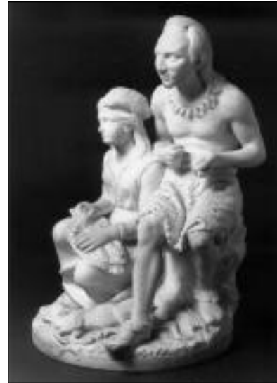
"The Old Arrowmaker and His Daughter" by Edmonia Lewis

Lewis soon gained recognition for her portrait busts and terra cotta medallions of