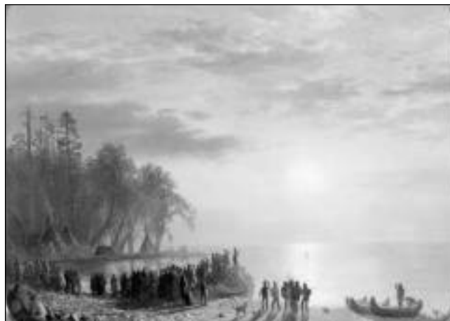
Departure of Hiawatha by Albert Bierstadt, 1868

From August 7 to October 14, 2001, the painting will be on loan to the National Museum of Western Art, Tokyo, for their exhibition entitled "American Heroism,"