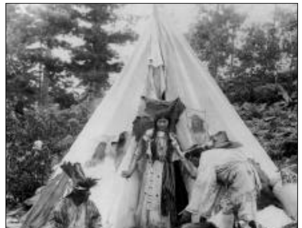
Hiawatha and Minnehaha in the 1901 Ojibway performance