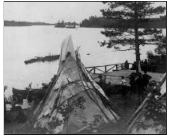
Performance stage overlooking the Lake Huron

The ceremonies were followed by much singing and dancing, of which the Indians