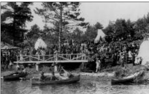
Ojibway performance of Hiawatha , with stage and onlookers, 1901