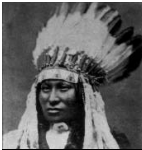
Chief Rain-in-the-Face (see poem on page 10)

"I had the pleasure of receiving yesterday the Report of the Society [of the Northern Antiquaries], addressed to its British and American Members. In return I send you a paper on the Indian Languages of North America, not yet published. It will appear in the North America Review for July next. By sending it now, you will get it probably some