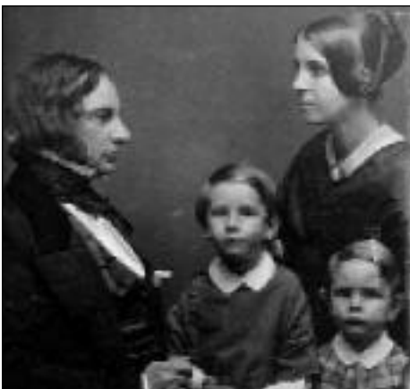
Daguerreotype of Henry and Fanny Longfellow with sons Ernest (left) and Charles, c.1849

The Bulletin will keep you apprised of recent discoveries, fill you in on past ones, and introduce you to people using the collection. And, of course, there will be historical facts and anecdotes about the residents of and visitors to the house since 1759.